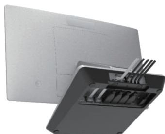
Connect hub to stand, supports separate operation