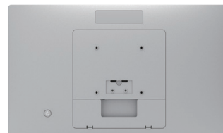
Supports wall and VESA mounting